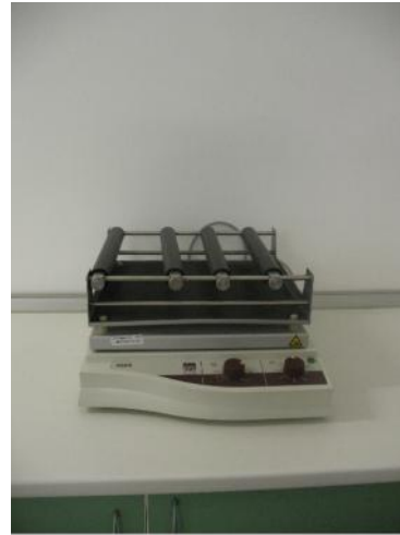
Agitator cu bare