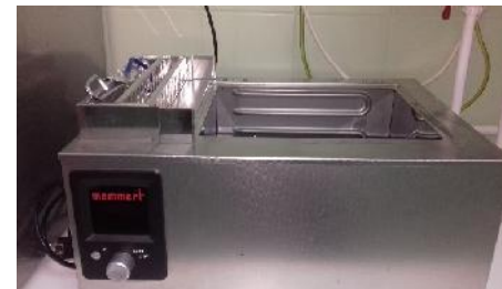
Baie de apă