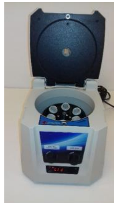
Centrifugă de masă